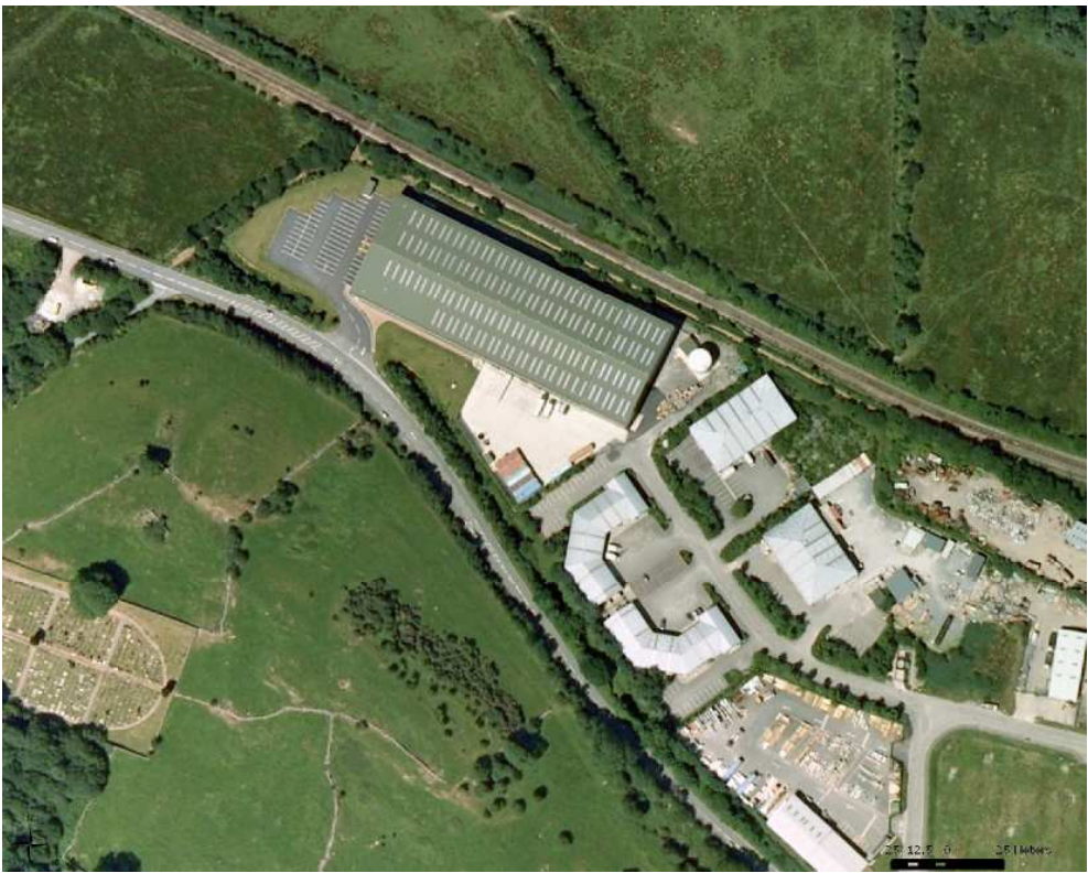
Aerial photographs of the site before and after building the warehouse.